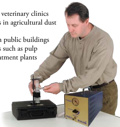
BioSampler set up with BioLitē pump